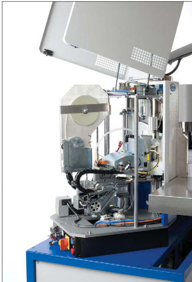
Easy access for maintenance.

Super 30 from Vacuumatic:- The most flexible, reliable and durable twin-head sheet counting machine for the Security Printing and Paper industry.