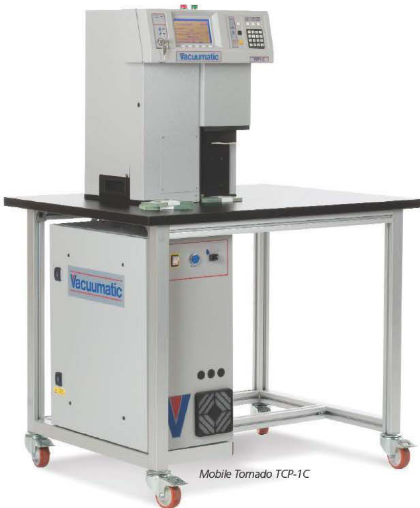
Mobile Tornado TCP-1C