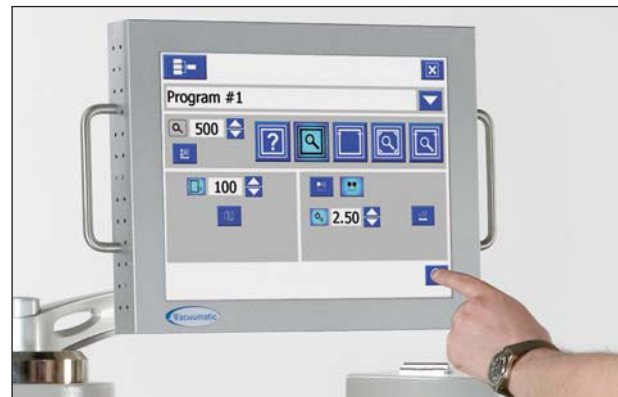
Colour touch screen control.