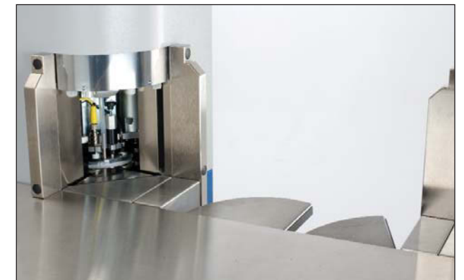
Robust knock-up area and droop supports.